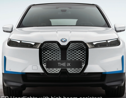
LED Headlights with high beam assistant

Car specifications may vary from the model shown. Options and features available are model-dependent.