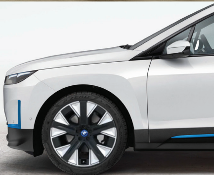
21" Aerodynamic wheels, 1010 Bicolour 3D polished