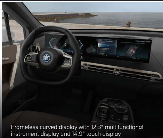
Frameless curved display with 12.3" multifunctional instrument display and 14.9" touch display